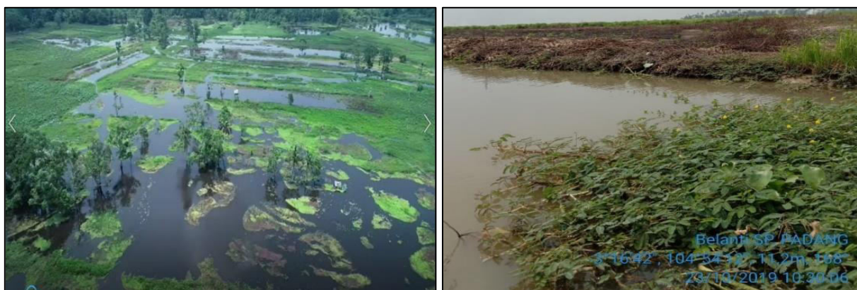
Figure 2. Left, most of the fields are inundated by a flood; Right, the grass “Setiduk”

Since 2008, paddy farmers in the village of Belanti have experienced crop failure. It's because paddy swamp lowland farmers have stagnant water almost all year (Figure 2, Left). The opening of land plantations of palm is huge allegedly strong trigger water overflow to paddy farmers, causing damage to the sponge feature on peat land in the region of agro-ecosystems. Aside from that, the issues in the fields are the "Setiduk" (Figure 2, Right) clump grass, which needs a high running cost to eliminate. If the fields become too dry, new grass species will be lost. Since the grass makes it impossible to remove the equipment as is, poison grass is used to turn it off, then burned, and finally rolled. Nonetheless, as a result, burning has been prohibited as a method of land clearing.